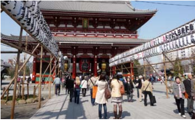
Many Japanese visit a shrine on January 1st to ask for blessing for the new year.

Having grown up in America, a comparatively young country, with a “melting pot” of culture, it has been fascinating to explore long-standing and deeply embedded Japanese customs. Over the New Year’s Holiday, we had the opportunity to see and hear about a number of the customs that have a prominent role in the way Japanese society celebrates the coming of a new year. Whether many people carry them out because it is actually important to them or just to keep in step with everyone else is hard to tell. Nonetheless, they are synonymous with Japanese culture and give insight into the way the Japanese look at life.